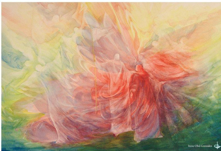
Pascua de Resurrección

Saturday, April 23 - 10:30 AM - Eurythmy Festival – page 3 12:30 – Annual General Meeting of the Rudolf Steiner Branch in the Richards Room (article on page 2)