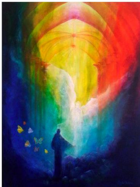
Melissa Frank, Angel

Tuesdays, 10:00 a.m. - Noon September 8 - Nov. 17, no class Oct. 20 Location: 8407 Pickards Meadow Road Chapel Hill, NC 27516