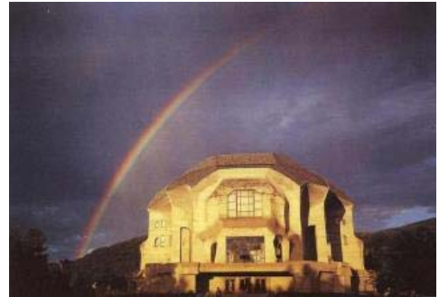
Goetheanum in Dornach, Swizerland, headquarters of the General Anthroposophical Society

If you are interested in membership in the Anthroposophical Society in America, information is available on the website www.anthroposophy.org You may also write to the Society at: Anthroposophical Society in America 1923 Geddes Ave.Ann Arbor, MI 48104-1797 or call: 734-662-9355